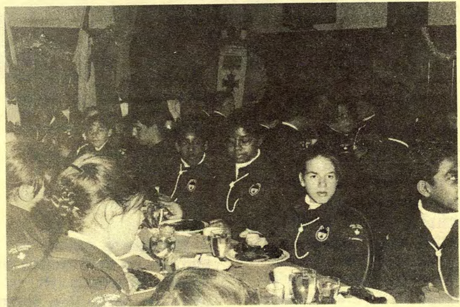
CHRISTMAS DINNER '92

of the shinanigans at the dinner. The attendance this year was, to say the least, phenomenal. The dinner was, as always, superb. The serving staff went out of their way to ensure the diners enjoyed the meal. Now, with the diner, staff and entertainment, the $12.50 cost was definitely well spent. The officers are looking forward to celebrating christmas next year once again. May our christmas tradition continue for many years to come.