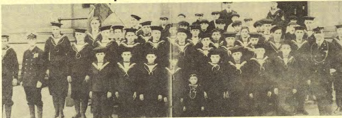
JTCVC SHIP'S COMPANY - 1920